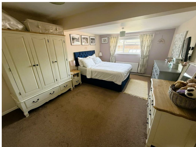
Bedroom One 17'04" x 11'03" (5.28m x 3.43m)

Double glazed window to the rear and radiator, built in cupboard.