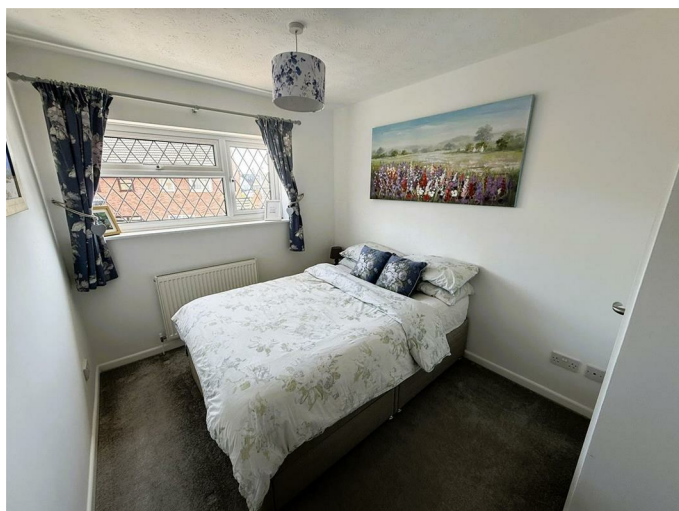
Bedroom Two 11'02" x 8'03" (3.40m x 2.51m)

Double glazed window to the front, radiator and wardrobe.