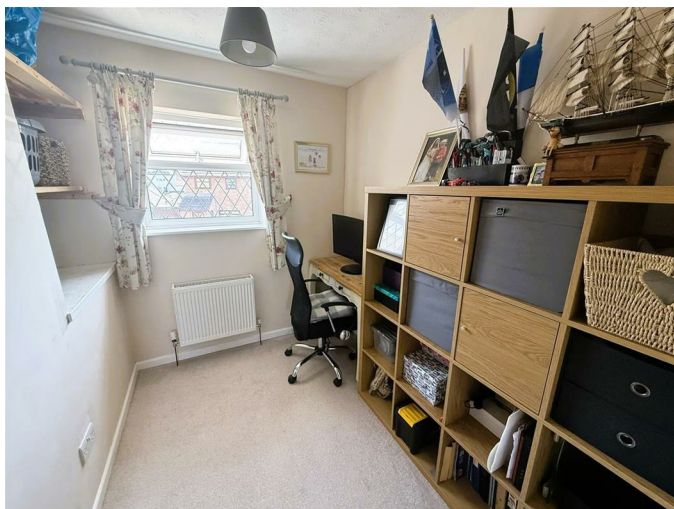
Bedroom Three 8'03" x 6'01" (2.51m x 1.85m)

Double glazed window to the front, radiator and wall mounted gas fired boiler.