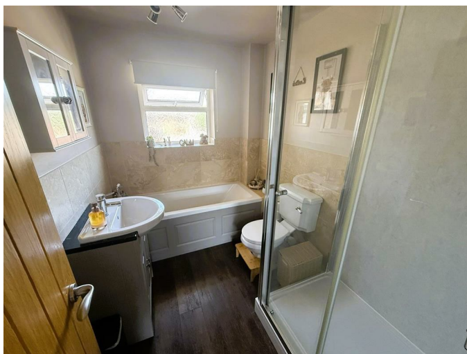
Bathroom 8'06" x 6'04" (2.59m x 1.93m)

Double glazed window to the rear, towel radiator, wash hand basin, vanity storage, toilet, bath, separate shower cubicle.